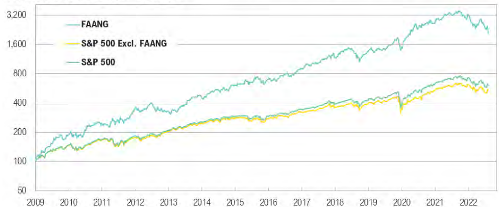
FAANG Stocks Dramatically Outpaced the Broader Stock Market for Over a Decade Growth of 100, 3/31/2009 - 11/4/2022

The reversal in the long-term market dominance of the FAANG stocks has loomed large over this year's markets. Although the FAANG acronym can now be used to refer to several large high-tech companies, for our purposes, we'll use the classic definition in this commentary and focus on Facebook (now Meta), Amazon, Apple, Netflix, and Google. From the end of the Global Financial Crisis in March 2009 to the peak of the bull market in December 2021, these five companies—the fast-growing darlings of the bull market—generated a total return of approximately 3,424%. Excluding the five FAANG companies, the S&P 500 returned only 529% over the same period—over 117% lower than the return when these companies are included. Due to this substantial and sustained outperformance compared to other equities, by December 2021, the FAANG stocks collectively had grown to account for almost 10% of the U.S. total market capitalization. 1